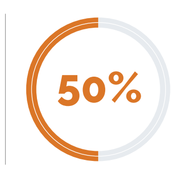
current companywide diversity underrepresented racial identities*